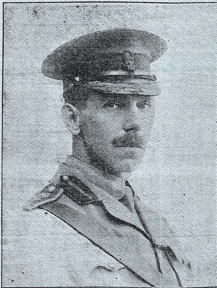
Block kindly lent by "W.A. Rifleman."