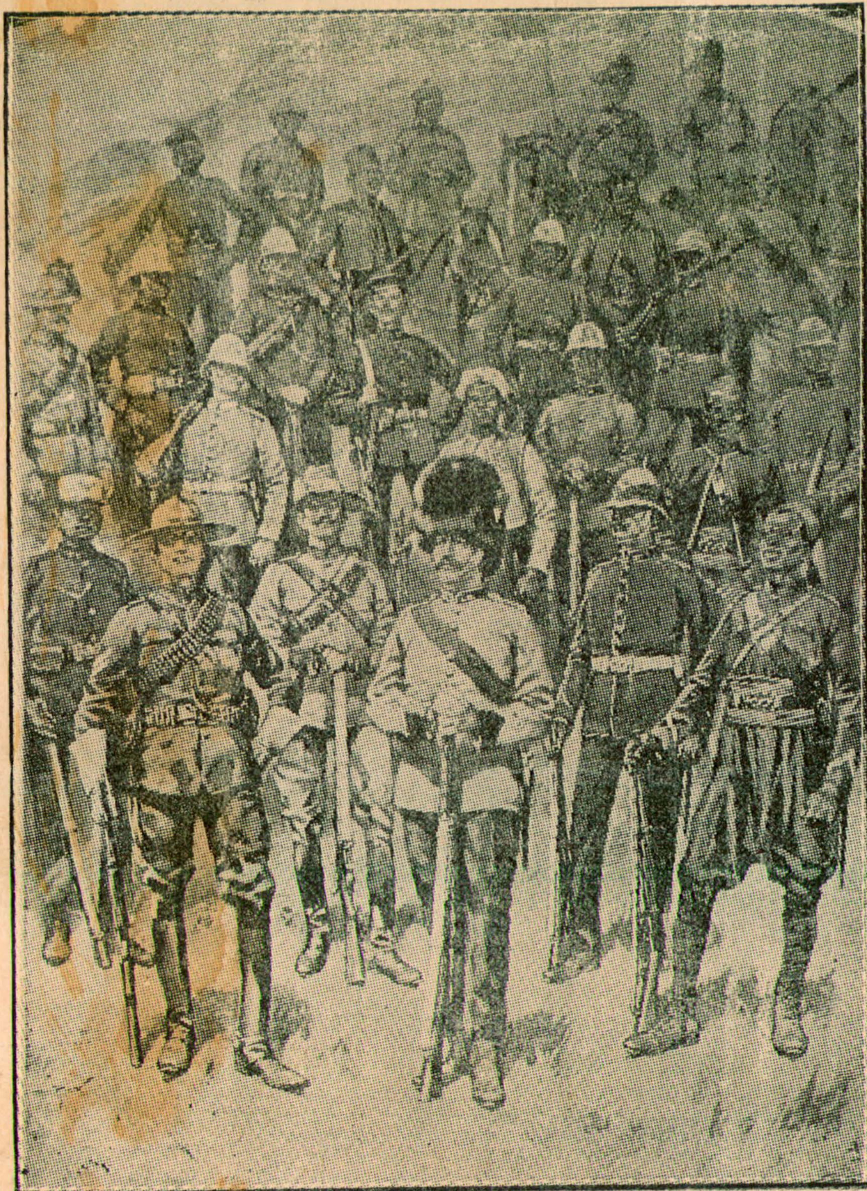
GUARDIANS OF OUR EMPIRE. Representatives of Oversea Forces.