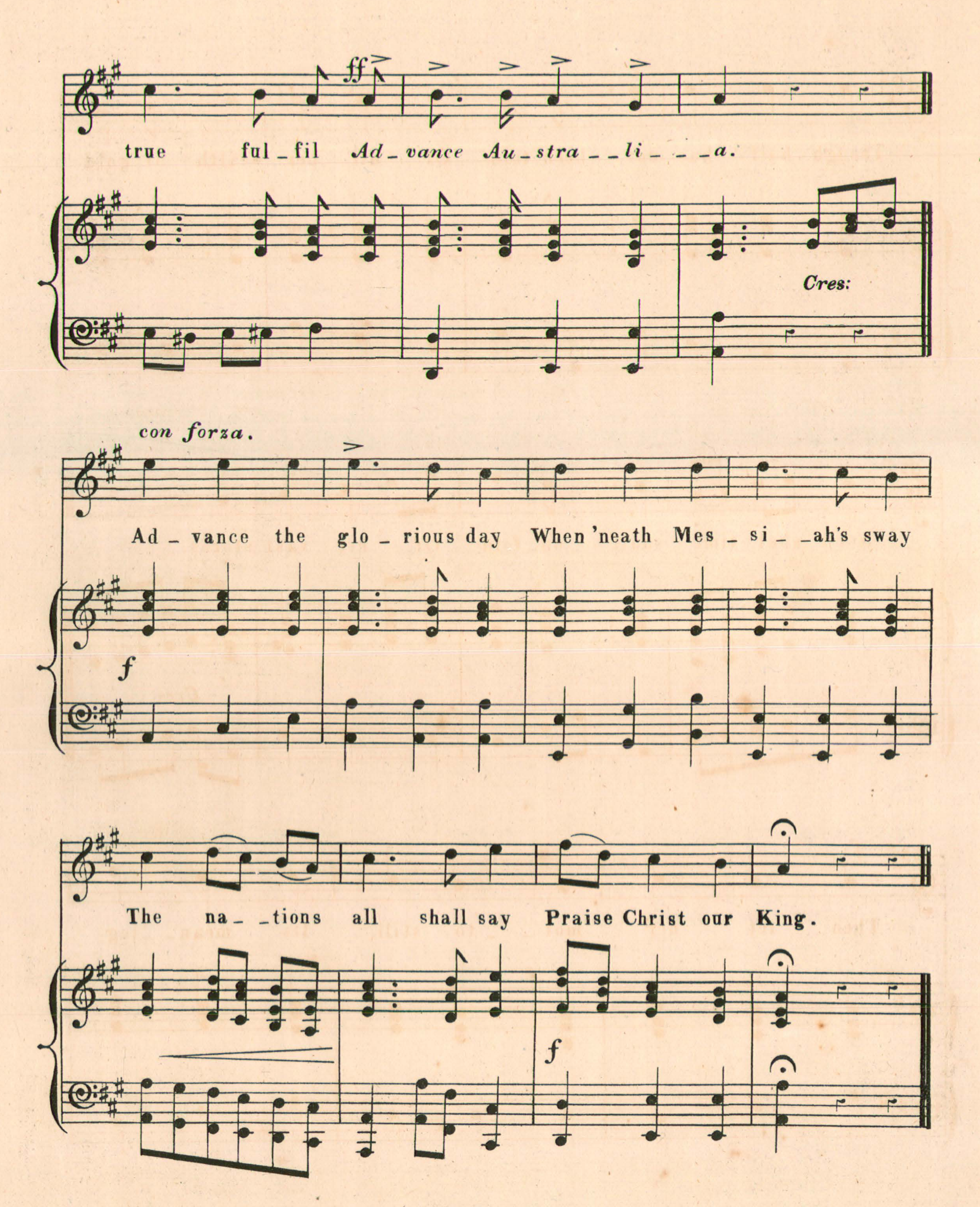
1263 . A .